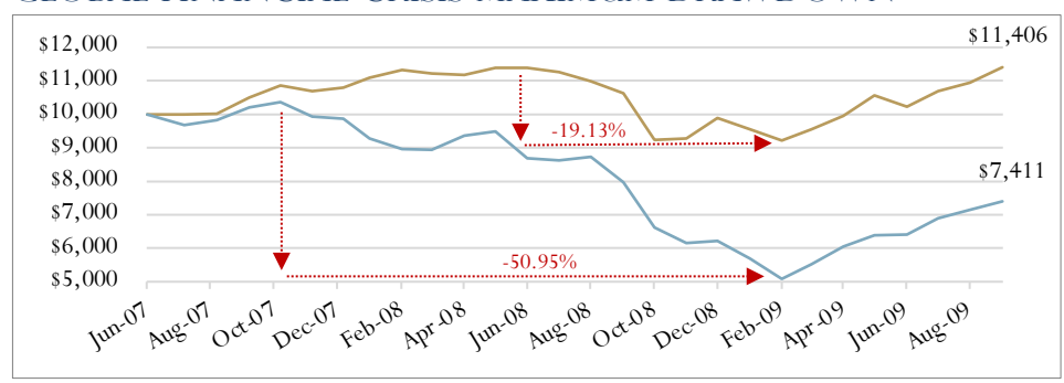
July 31, 2007 - September 30, 2009